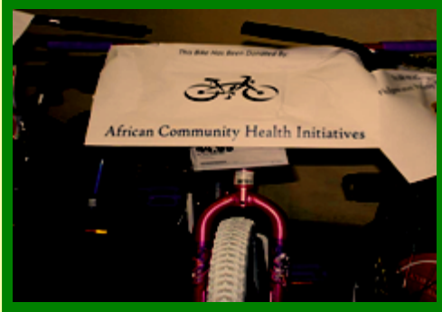
Bicycle donated to Teen’s Challenge, Brockton, MA by ACHI.

ACHI co-sponsored a health fair event that was well attended by diverse groups of people from various communities. The